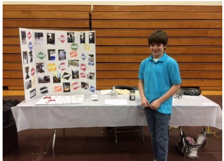
Making Maple Syrup, Science Expo