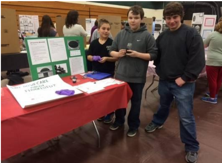
Ferro Fluid, Science Expo